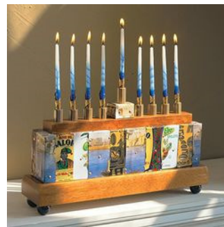
This contemporary mixed-media menorah is constructed from recycled olive oil cans, copper nails, mahogany, and wooden beads. Brass fittings hold the candles.